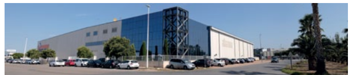
Headquarters Spain - Valencia