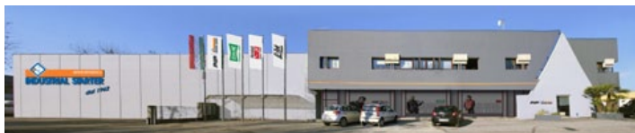
Italian Headquarters - Altavilla Vicentina (Vicenza)

Sosnowiec, Polska Phone: +48 32 260 0026 www.industrialstarter.com - biuro@industrialstarter.pl